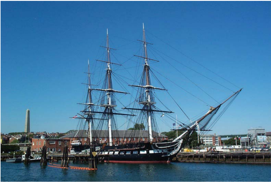
USS Constitution, part of the Freedom Trail

The Freedom Trail is a history-filled, self-guided walking tour featuring sites made famous during the American revolution and later historic periods, including Paul Revere's House, the USS Constitution ("Old Ironsides"), Bunker Hill, and the Old North Church. The tour is several miles long, so bring comfortable shoes. Admission to the USS Constitution is free (worth the wait to get on). Begin at the Government Center T stop on the Blue or Green Lines. See the National Historical Park Visitor's Center on the Boston Common for maps and information.