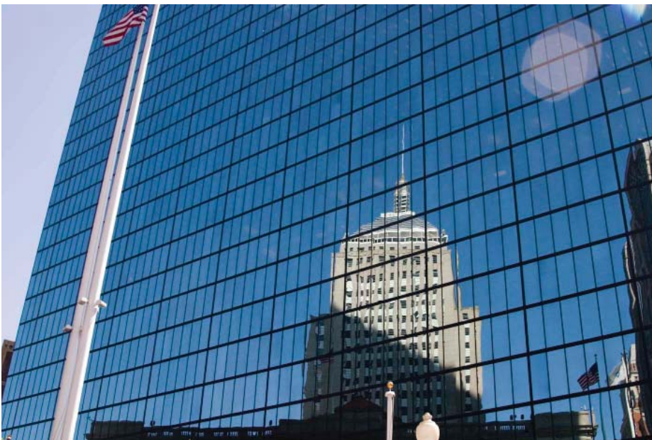
Old John Hancock Building reflected in John Hancock Tower (designed by I. M. Pei) at Copley Square, Back Bay, Boston

Copley Square, in the Back Bay, is the site of the historic Boston Public Library, Trinity Church, the John Hancock building, the Prudential Tower (with an excellent observation deck), and the Prudential and Copley Place Malls (with over 300 stores) (Copley T stop on Green line, or Back Bay/South End stop on Orange line)